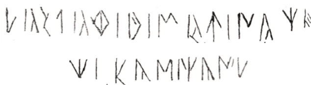
Figure 2. Example from Battista 1951:307 showing OLD ITALIC LETTER NORTHERN TSE.

The text in an Old Italic font: ΦVTIKAKOΣ[. .]KOΣ YV / ΔOMOM TPVMSIKATEI TOLEP The text in a North Italic font: ΦVXIKAKOZ[. .]KOZ VV / ΔOMOM XΔAMASIKATEI TOLEP Text reversed for LTR display butijakos[. . .]kos ?? / donom trumusijatei toler