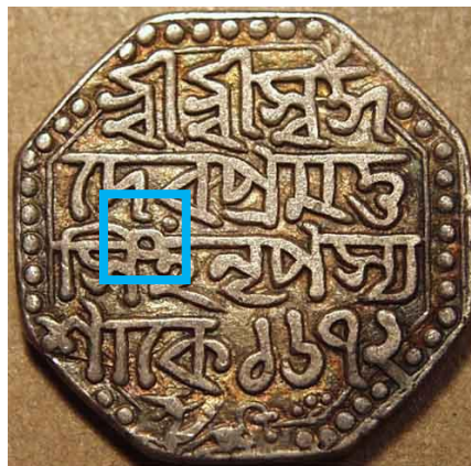
Figure 2. Coins using top right spacing anusvara.