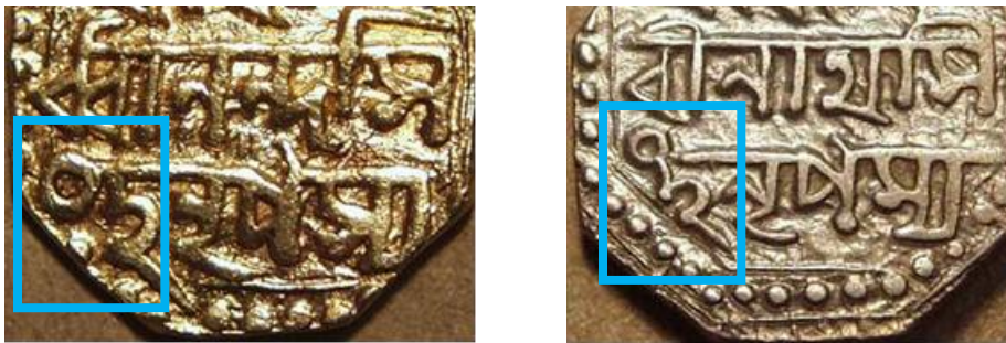
Figure 4. Coins using top right spacing anusvara at the beginning of a line.