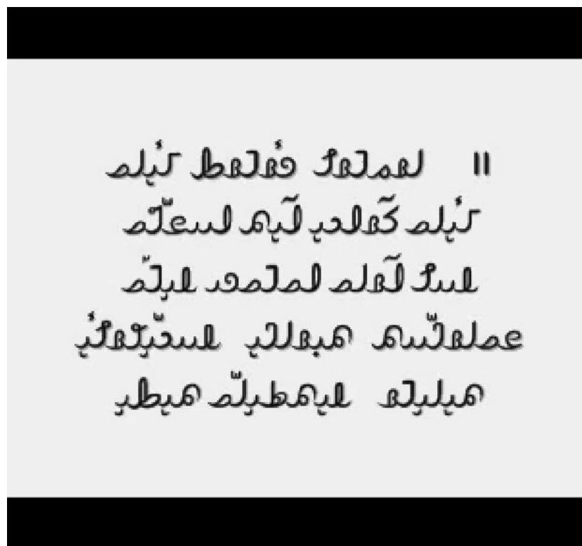
Figure 9: Use of a Rohingya typeface in a digital video (from noorismail52 2011b: frame 103).