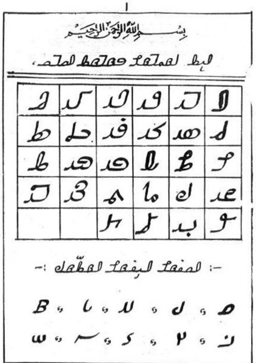
Figure 3: Chart of Rohingya script from a hand-written primer (from Ruwaingya Zuban Komiti (A): 1).