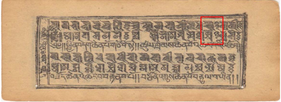
Figure 1: A manuscript of the Mañjuśrī-nāma-saṃgīti written in Lantsa, Soyombo, and Tibetan showing the soyombo Mark pluta mark.