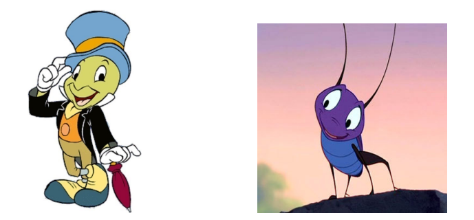
Figure 2: Disney characters Jiminy Cricket and Cri-Kee from Pinocchio and Mulan

of impending rain or a financial windfall. Depending on the color of the cricket, it can also imply illness, death, pregnancy, or forthcoming money.<sup>1</sup> In Chinese history, people often enjoyed the "song" of the cricket and kept them in small cages. In modern Chinese society, the cricket is a sign of good luck and prosperity.<sup>2</sup> Crickets often make appearances in Native American allegories, playing such important roles in lessons on morality that they have been seen on totem poles.<sup>3</sup> The Disney corporation capitalized on the symbolism of a cricket early on and has included a cricket as primary characters in two prominent films: Jiminy Cricket in Pinocchio (1940), and Cri-kee in Mulan (1998).