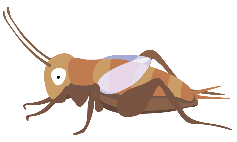
Figure 6: The proposed cricket emoji in color

<sup>6</sup> "Fight World Hunger by Eating Bugs, Urges U.N.": http://newsfeed.time.com/2013/05/15/fight-world-hunger-by-eating-bugs-urges-u-n/